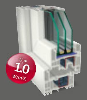
Narrow frame with sash