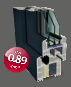
High frame with coloured sash and confirmed ift passive housecompatibility

Your GEALAN partner will be happy to provide you with advice: